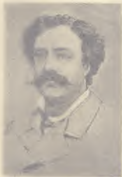
EDMONDO DE AMICIS